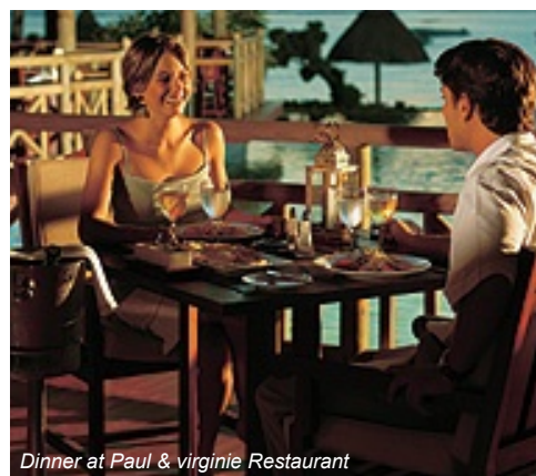
Dinner at Paul & virginie Restaurant