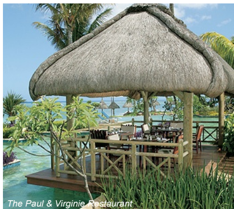
The Paul & Virginie Restaurant